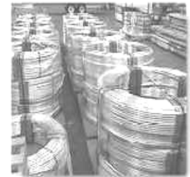
Table II "Tube in Coil"