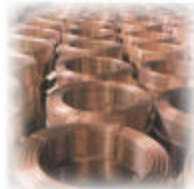
Spooled Coils (Bulk)