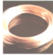
Random Bunch Coils